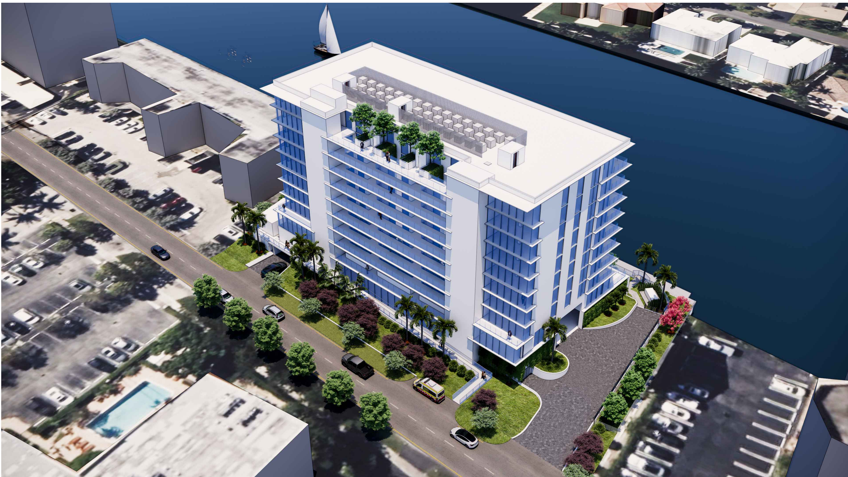
Aerial View from North-East Corner, looking South-West