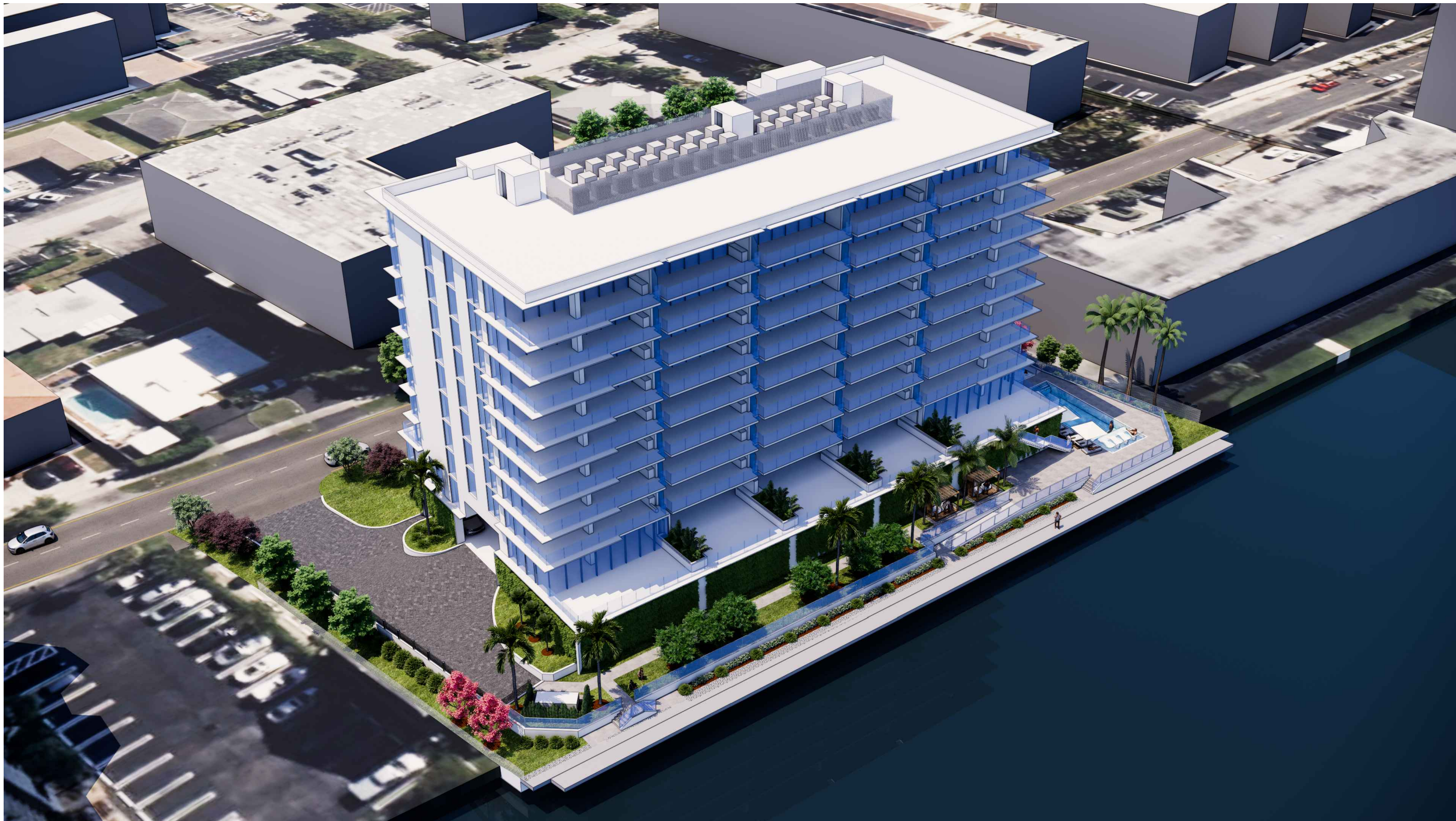
Aerial View from North-West Corner, looking South-East