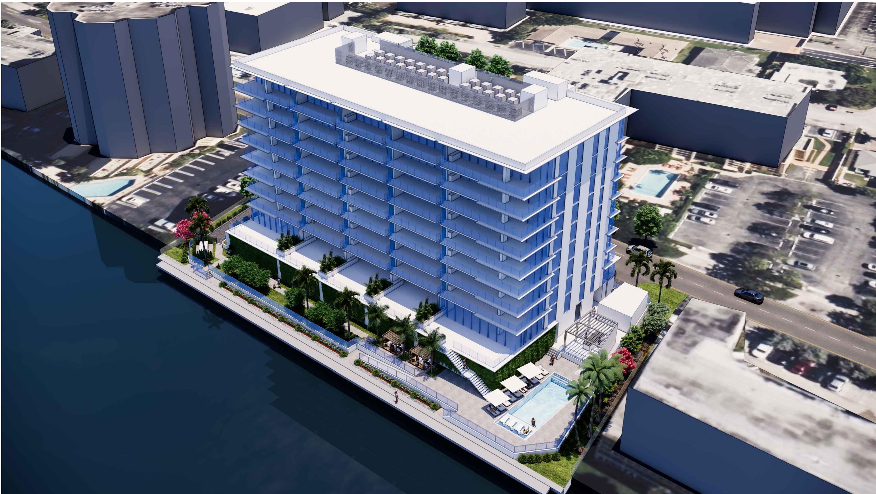
Aerial View from South-West Corner, looking North-East