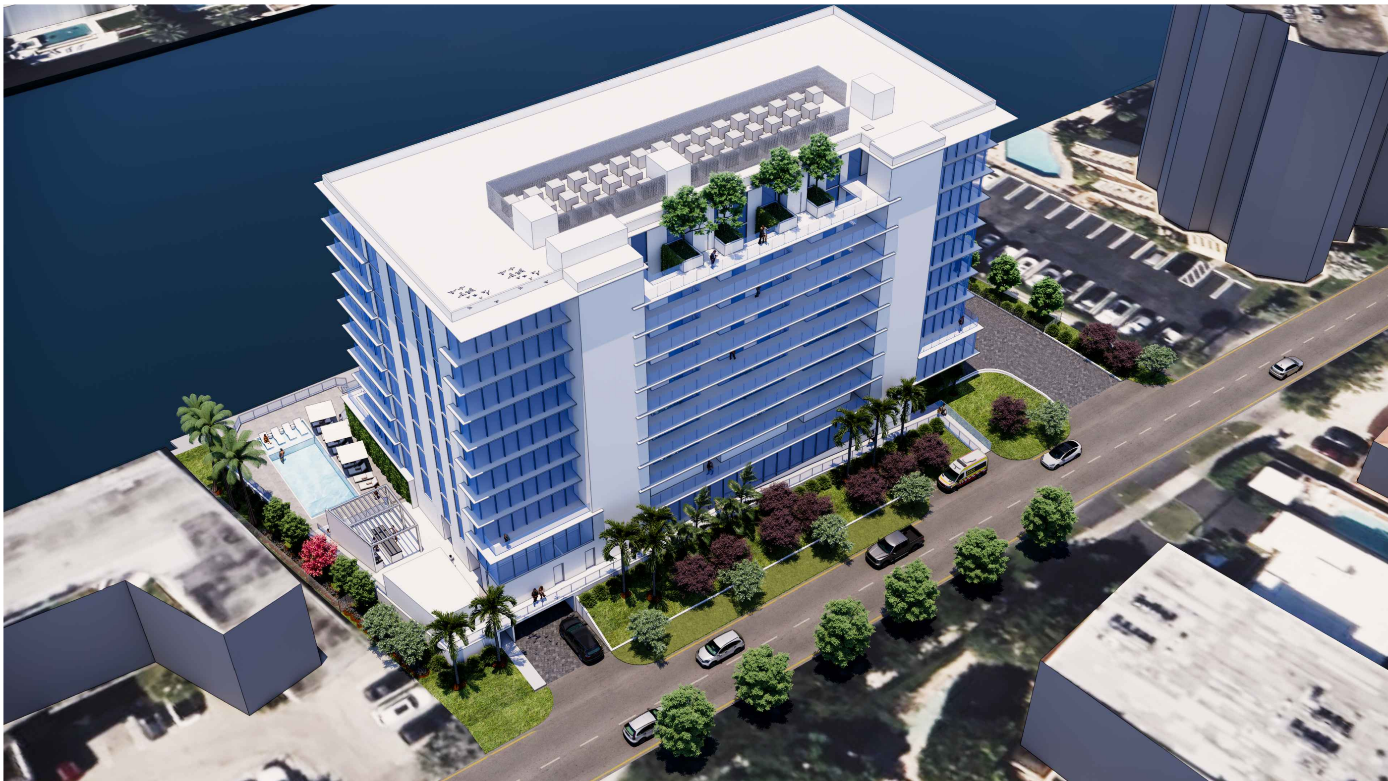
Aerial View from South-East Corner, looking North-West